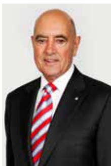
THE HON. JOHN OLSEN AO

SA Football Commission Chairman and SANFL President